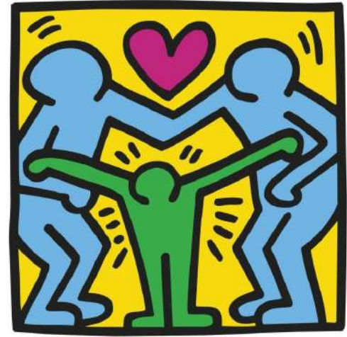
(left) Earth day, (middle) Best Buddies, (right) Untitled three figures. Lithograph, Keith Haring 1989