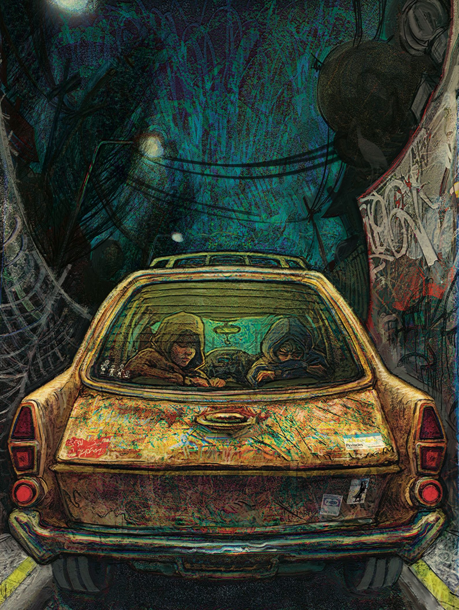
Illustration by Kyro Phoenix Carpenter