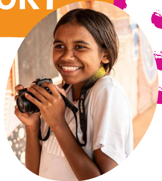
Wiluna Youth Centre

Our residencies were delivered in the Kimberley, Pilbara, Midwest, Goldfields-Esperance, Great Southern, South West, Peel, and Perth Metro Regions.